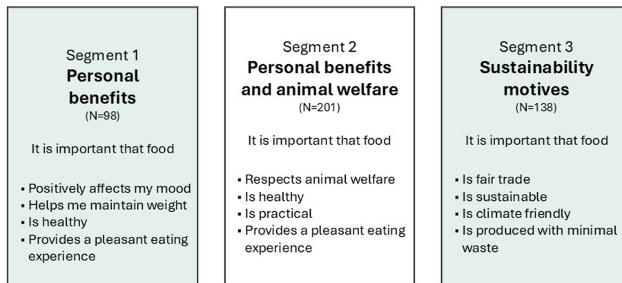
FIGURE 3 Food choice motives characteristic of the three consumer segments identified through clustering.