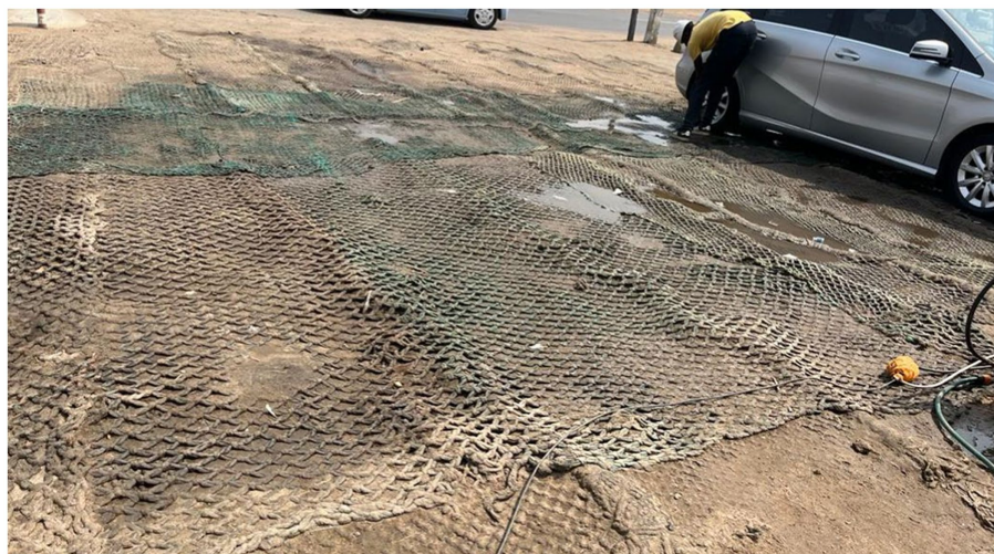
FIGURE 3 End-of-life fishing nets as floor covering at a carwash in Walvis Bay, Namibia.