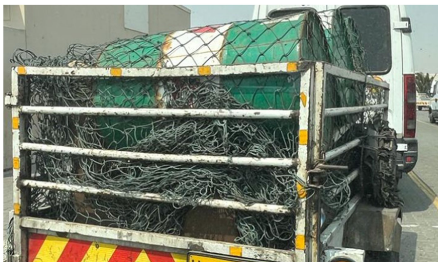
FIGURE 4 End-of-life fishing nets used to cover goods during transportation from Walvis Bay to various locations in Namibia.

frequent use would ultimately lead to wear and tear, as revealed by the fleet managers, thus making replacement of EOL fishing gear necessary (Table 2). The lifespan of fishing nets is on par with estimates from Scotland (Large polyethylene demersal: 3 years, small polyethylene demersal: 5 years, nylon pelagic nets: 8 years, polyethylene beam trawl nets: 0.5 years, nylon gill nets: 0.5 years; Chambers et al., 2021) and Norway (trawl: 2.8 years, purse seine: 10.2 years, Danish seine: 3.9 years, gillnets: 2.1 years; Deshpande et al., 2019). Replacing fishing gear lost at sea was also discussed in Nogueira et al. (2022). Our findings support the premise that fishing nets and lines should be designed and manufactured to be resilient and long-lasting in order to enhance resource efficiency and the ability to be reused and recycled. Many factors influence the lifespan of a fishing gear, for example if fishing nets are exposed