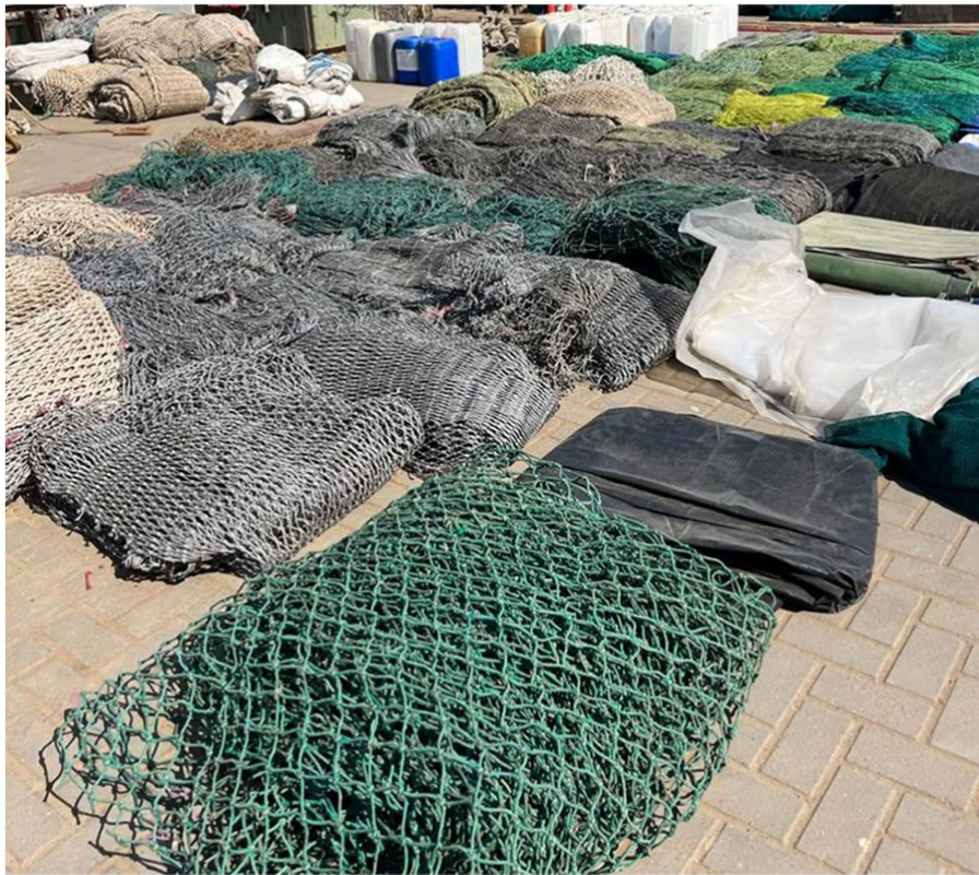
FIGURE 2 End-of-life fishing nets, lines and ropes at the Kuisebmond open market in Walvis Bay, Namibia prepared to be sold for various purposes.