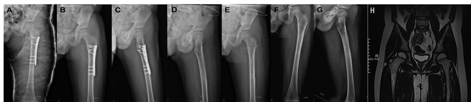
FIGURE 3 Postoperative radiographs and magnetic resonance imaging of the left hip and thigh. (A) Radiograph on postoperative day 2 showed an adequate reduction of the hip joint and subtrochanteric fracture with an excellent implant placement. (B–E) Fracture healing was observed before and after the removal of internal fixation (16 months after the primary surgery). (F,G) No signs of osteonecrosis, early closure of the epiphyseal plate, heterotrophic ossification, and osteoarthritis were observed on the anteroposterior and lateral radiographs at 3 years of follow-up after injury. (H) MRI of the hip at 3-year follow-up after injury showed no signs of osteonecrosis.

described by Pombo and Shilt (5). At 4 weeks post-injury, the cast was removed to allow mobilization exercises. Fracture union was achieved by 8 weeks postoperatively. Partial weight-bearing walking with crutches was initiated at 2 months, progressing to full weight-bearing walking at 3 months post-surgery. The fixation was removed 16 months after the initial surgery. During follow-up, no complications, such as infection, re-dislocation, fixation failure, or vision issues, were observed. At the last follow-up (3 years postoperatively), the patient demonstrated a satisfactory functional outcome with a full range of motion in the left hip and knee joints. He returned to his previous activity level without pain or gait abnormalities (Figure 4). No clinical or radiological evidence of leg length discrepancy, premature epiphyseal plate closure, heterotrophic ossification, post-traumatic arthritis (PTA), or avascular necrosis (AVN) was identified (Figure 3).