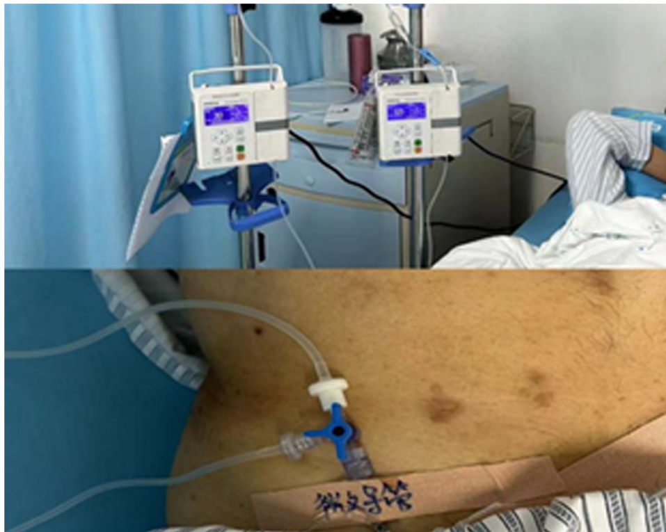
FIGURE 1 HAIC patients with lidocaine pumped through the hepatic artery.