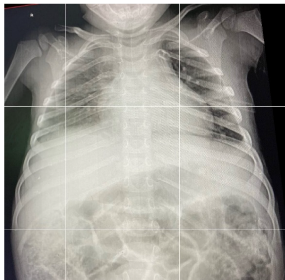
FIGURE 4 An AP chest x-ray taken 48 h postoperation prior to the removal of the chest tube.

However, the patient in this study presented with an isolated pericardial rupture with BTDR. Following blunt trauma, most pericardial ruptures occur in the left pleuropericardial region (12). Pericardial rupture is an elusive diagnosis, with most cases identified intraoperatively (5, 6). Similarly, the defect in the pericardial sac of our patient was identified intraoperatively.