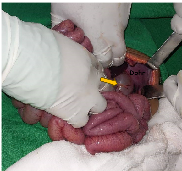
FIGURE 3 The yellow arrow indicates the transverse colon, and DPHR indicates the diaphragm.