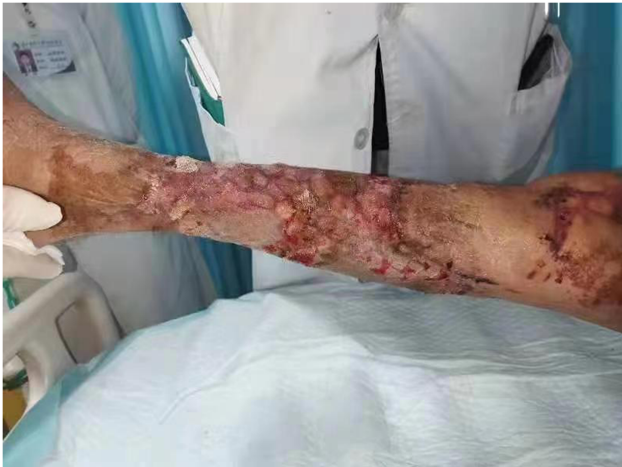
FIGURE 3 Postoperative right lower extremity ulcer wound repair 1 month after surgery.

An antiphospholipid syndrome is characterized by persistently elevated antiphospholipid antibodies. Main clinical manifestations include Thrombocytopenia, Livedo reticularis, Stroke, Transient ischaemic attacks, Deep vein thrombosis, Pulmonary embolism, Epilepsy, Skin ulcers, Valve thickening/dysfunction, Vegetations, Myocardial infarction, Superficial thrombophlebitis and Autoimmune haemolytic anaemia, and the symptom of skin ulcer was reported occurs in about 1.7%–5.5%. However, there are no reports of massive necrosis of the skin, soft tissues and severe inflammatory reactions (1). This case reports a rare non-standard presentation of APS, the first clinical manifestation was only a large area of unilateral subcutaneous adipose tissue severe inflammation induced by extensive skin ulceration of the lower limbs, through the joint efforts of the Department of Rheumatology and Immunology, the Department of Critical Care Medicine and the Department of Plastic and Reconstructive Burn Surgery of the authors' department, to timely control the development of the patient's large area of necrosis of the lower limbs of the fat tissues induced by the APS and to clarify the cause of the disease, and stabilizing the vital signs while targeting treatment of the APS for three months after the development of the APS and the healing of the ulceration of the right lower limbs