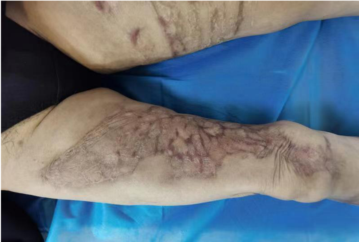
FIGURE 4 Status of the right lower extremity ulcer after healing one year after surgery.