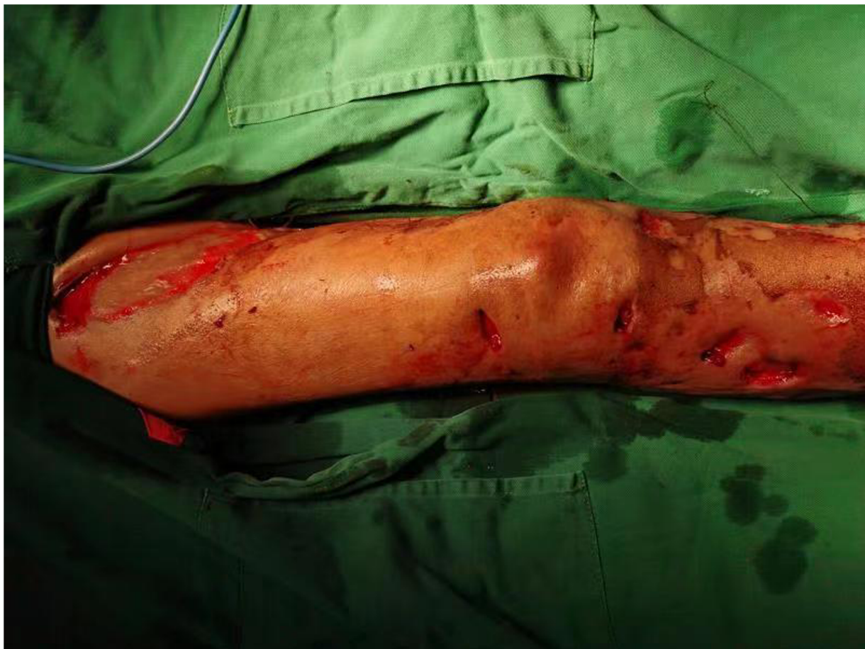
FIGURE 1 Extensive preoperative ulceration of the right lower extremity.

Before the diagnosis was definitive, the patient's general condition was critical and life-threatening, and the decision was