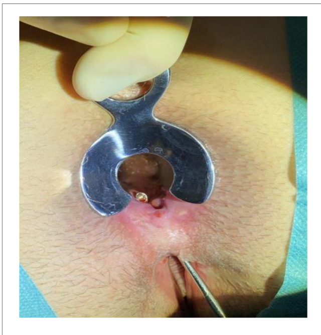
FIGURE 3 Probe position. The probe is inserted inside the rectovaginal fistula.

The next step involved the excision of the entire fistula tract that extended between the rectum and vagina. However, considering the proximity of the anal sphincter and the potential risk of compromising its integrity and subsequent anal incontinence, the width of the excision was deliberately limited (Figure 4). This cautious approach aimed to balance the complete removal of the fistula tract with the preservation of anal sphincter function.