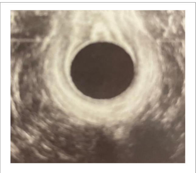
FIGURE 1 Endoanal ultrasound. The opening of the fistula on the anterior wall was shown on the ultrasound picture above the probe (black circle).

Informed consent was obtained from the patient after a detailed discussion regarding the risks and benefits of the available therapeutic options for managing the rectovaginal fistula. The patient actively participated in the decision-making