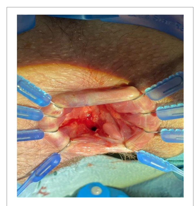
FIGURE 4 Fistula excision. The picture shows the result of the minial excision performed during the first surgery.