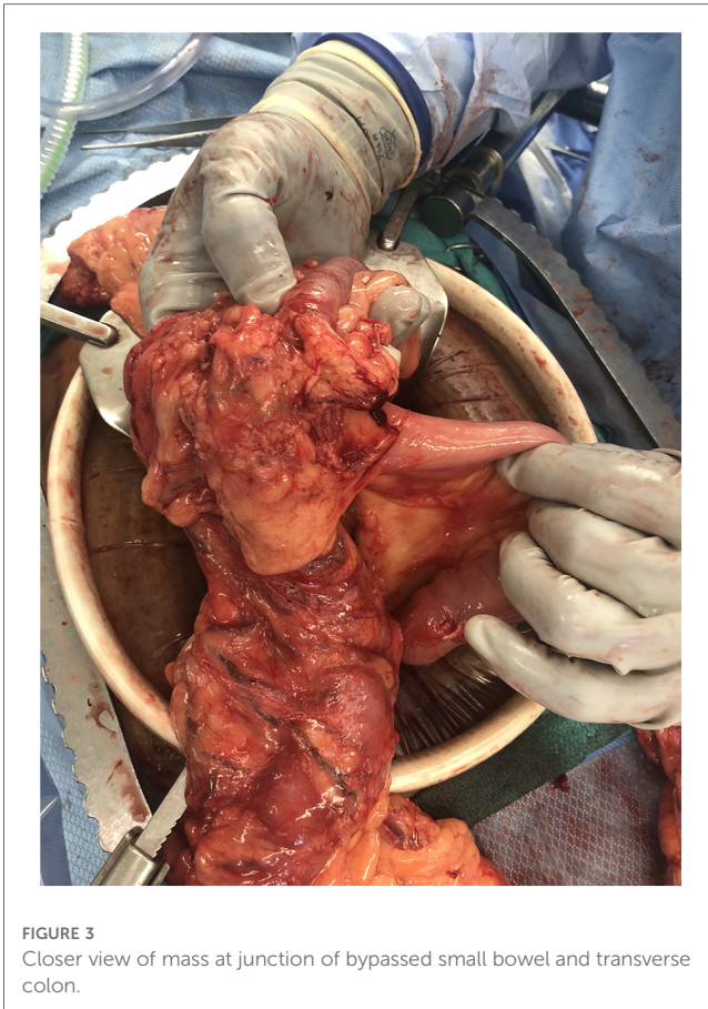
FIGURE 3 Closer view of mass at junction of bypassed small bowel and transverse colon.

Flatus on POD 9 prompted a clear liquid diet, advanced to a gastrointestinal (GI) soft diet the following day with bowel movements. On POD 12, he was discharged in stable condition without TPN. Six weeks later, he was seen in the outpatient setting, with only complaint of mild constipation. He was instructed to follow up in 4 months for CEA, colonoscopy, and CT. Unfortunately, he was lost to follow-up.