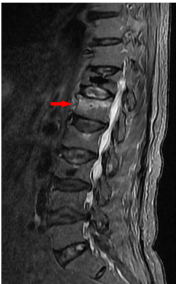
FIGURE 1 Preoperative MRI of lumbar spine suggested compression fracture of L1 vertebral body.

An 85-year-old male patient was admitted to the hospital because of “low back pain with limited activity for 20 days”. The patient’s height 172 cm, weight 64 kg, BMI 21.6. The patient had a history of hypertension, denied a history of coronary heart disease, and had a history of thoracolumbar 12, lumbar 4, and lumbar 5 vertebroplasty. Lumbar magnetic resonance examination ( Figure 1 ) was performed on admission. The diagnosis was fresh compression fracture of lumbar 1 vertebral body. Percutaneous vertebroplasty of lumbar 1 vertebral body was performed. The surgical process is as follows: first, locate the lumbar 1 vertebral body, apply local anesthesia at the insertion point, puncture, and fluoroscopy show that the working channel enters the anterior one-third of the lumbar 1 vertebral body along the pedicle of the vertebral arch. Mix bone cement to a wire drawn shape, inject 2.5 ml of bone cement into the right channel to the vertebral body, and the fluoroscopy shows that