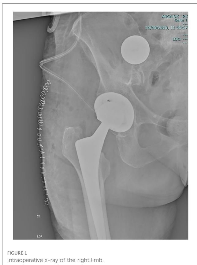
FIGURE 1 Intraoperative x-ray of the right limb.

The use of the laparoscopic technique to explore the peritoneal cavity is a well-established practice (12). The pelvic exposure can be easily obtained through a standard periumbilical port. The anatomical structures that can be injured due to a foreign body migration from the coxofemoral region to the pelvic entrance are the iliac vein and artery, the hypogastric vein, and the ureter. All these structures are easily displayable by an exploratory laparoscopy, while an anterior laparotomic approach could not