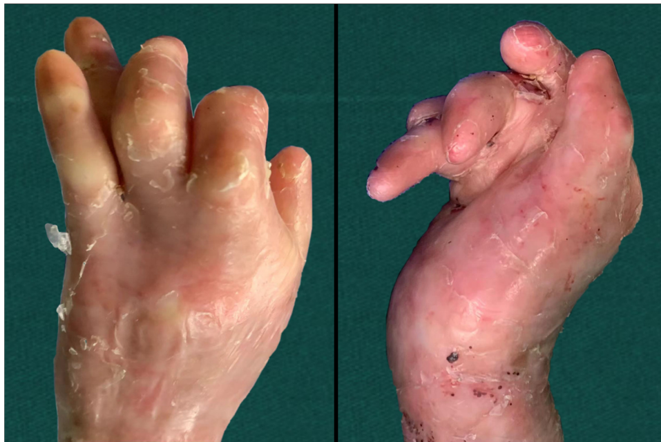
FIGURE 1 Preoperative photographs.

ends of the fingers were monitored to observe the blood supply in the fingers. After the operation, the dressing was changed on a weekly basis (Figure 2). During dressing change, all dressings were removed, washed repeatedly with a large amount of iodophor solution, hydrogen peroxide, and normal saline, and