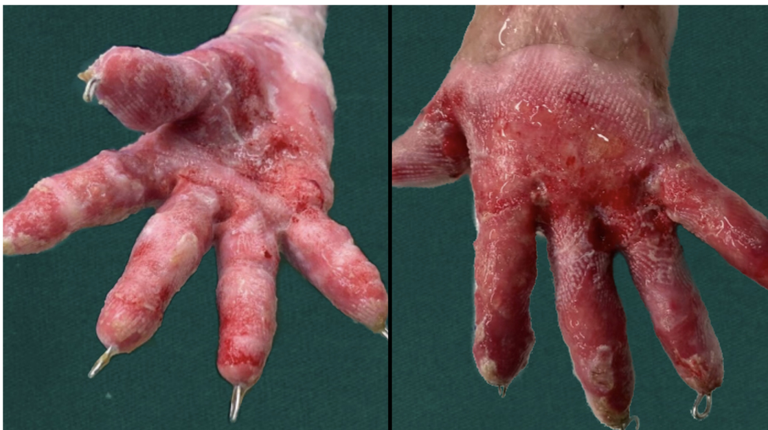
FIGURE 2 Palmar and dorsal photos of the patient after the first dressing change.

the hands were wrapped with an elastic bandage. With the growth of the epidermis of both hands, each dressing change can gradually reduce the use of dressings. Given that the long-term fixation of Kirschner wires may lead to infection and joint injury, it was removed after three dressing changes.