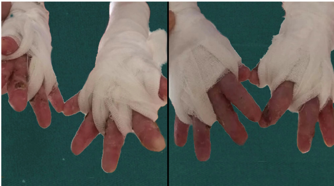
FIGURE 4 Soft brace fixation.

the formation of new blisters on the patient's hands after the operation, adhesion may occur after wound healing, resulting in scar contracture, which will eventually develop into a "glove hand" deformity. During the follow-up of the patients, we found that scar contracture deformity recurred in varying degrees in both hands, with recurrence being more noticeable in non-profit hands (14). Scar contracture deformity of both hands will not only lead to muscular atrophy but also may influence the development of patients' bones, resulting in considerable limitations in everyday self-care abilities.