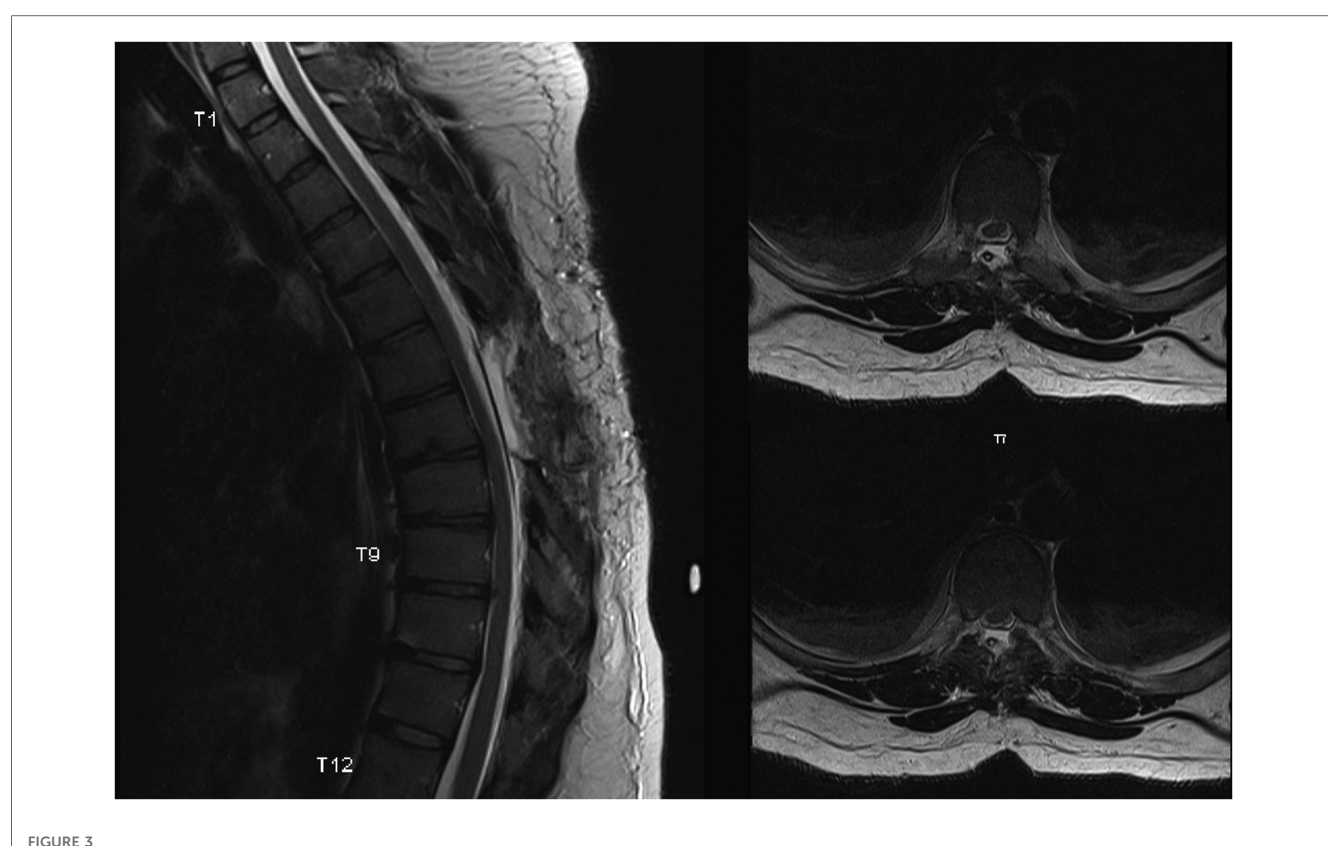
A sagittal T2 weighted and corresponding axial cross sections at two levels. MRI shows a complete resolution of the mass effect on the thoracic spinal cord.

pain. He continues to be treated with oral analgesics for this condition.