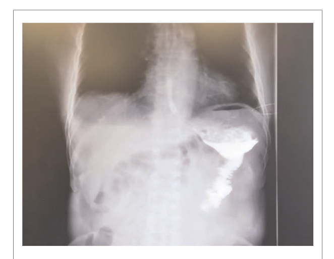
FIGURE 3 Six-month postoperative fluorography showing smooth passage of oral water-soluble contrast medium without anastomosis stenosis.