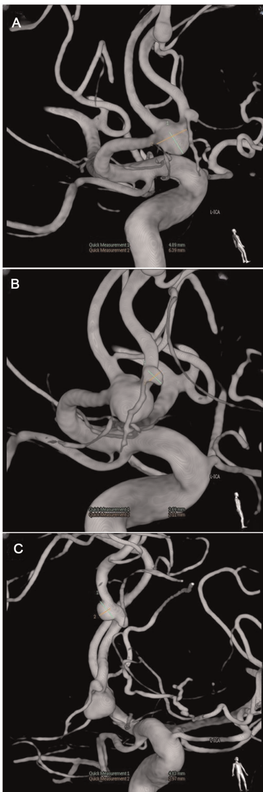
FIGURE 2 Digital subtraction angiography showing three aneurysms' size and location.

type of intracranial tumor after glioma. The incidence increases with age and is often seen in people aged 60–70 years. The female-to-male ratio is 2:1, which may be associated with progesterone and PR-positive meningioma. The absence of NF2 is a risk factor, and ionizing radiation (IR) exposure also plays a role as well (11). It has been reported that only 1.1% of patients with meningioma have a coexisting aneurysm (8).