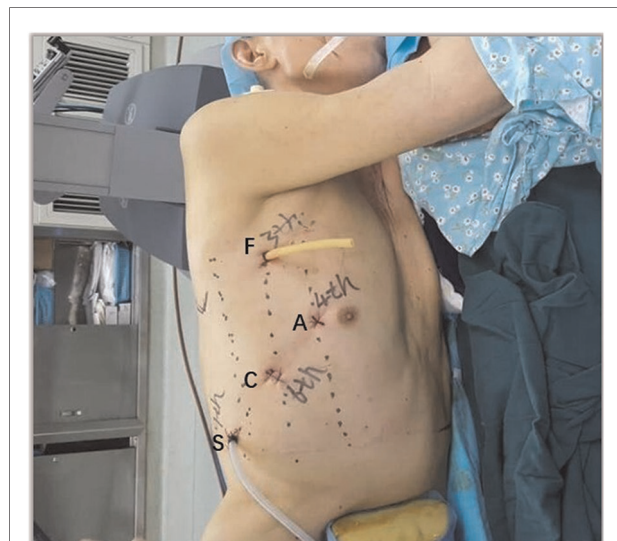
FIGURE 1 Port placement for the Da Vinci Si System using three robotic arms (thoracic cavity). C, camera port; A, assistant port; F, first robotic arm; S, second robotic arm.

Abdominal incisions for the patients with esophageal cancer undergoing the McKeown approach: the first, second, and third arms were selected for abdominal operation. The incisions were as follows: the camera port was placed above the level of the umbilicus (12 mm trocar); the incisions for the first/third