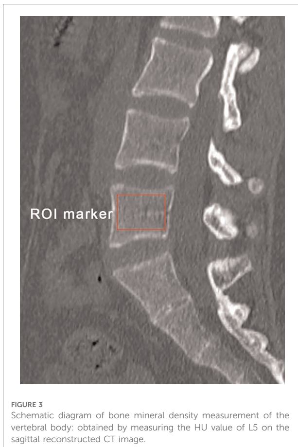
FIGURE 3 Schematic diagram of bone mineral density measurement of the vertebral body: obtained by measuring the HU value of L5 on the sagittal reconstructed CT image.

images (Figure 3) (16). Parameters related to the fractured vertebra were measured on radiography, including preoperative kyphotic angle (KA), preoperative anterior-to-posterior body height ratio (AP ratio), anterior vertebral