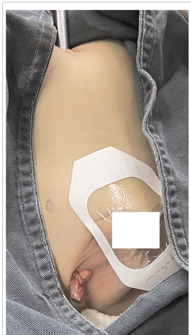
FIGURE 2 We turn off the light source and release the pneumoperitoneum to keep the hernia sac exposed.