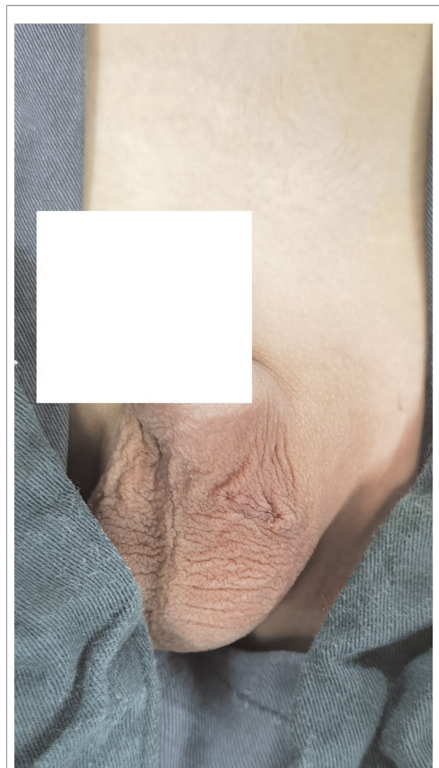
FIGURE 4 Postoperative scrotal incision appearance.