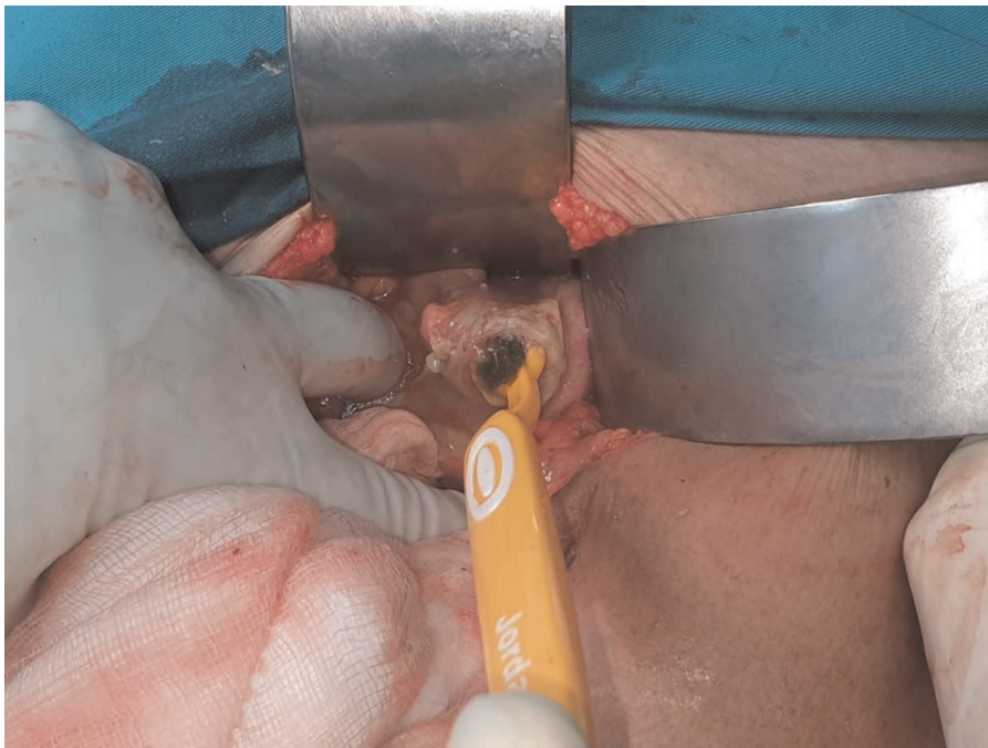
FIGURE 2 | Extraction of the toothbrush from the rectum.