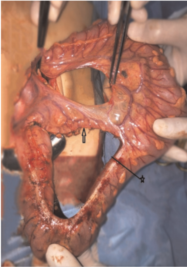
FIGURE 2 | The arrow indicates the preserved sigmoid arteries. The tweezers indicate ligated left colic artery. The distance between the ends of the tweezers indicates how much bowel is free. ★—border of the colon resection.

connects the sigmoid arteries to the left branch of a. colica media.