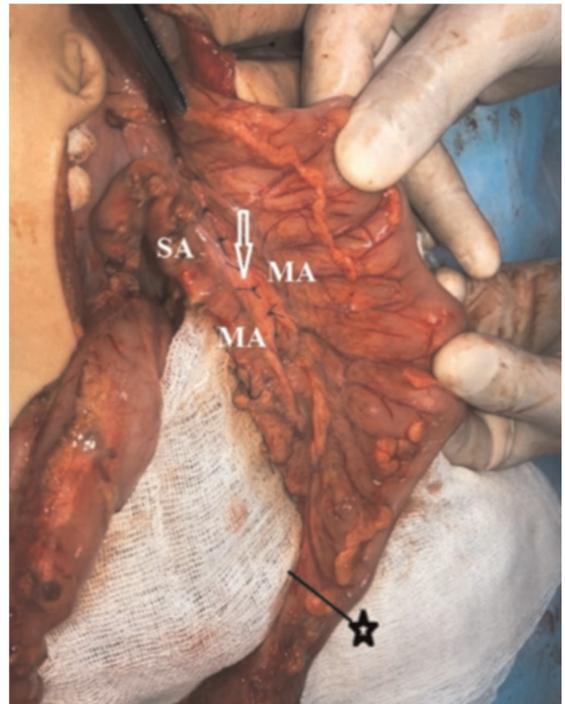
FIGURE 3 | MA, marginal artery; SA, sigmoid arteries. The lengthening of the sigmoid arteries occurs due to the mobilization of the marginal artery. The arrow indicates the peritonization of the “window”. ★—border of colon resection.

ACS, a. colica sinistra; n, number of patients.