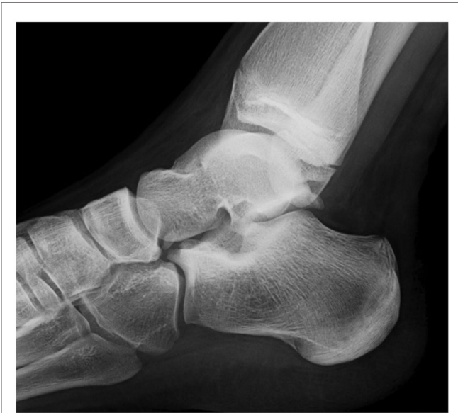
FIGURE 3 | Xray 6 months after surgery confirming complete excision of the lesion without residual pathology.

Conservative treatment includes physical therapy, bisphosphonates or NSAIDs. Clinical evidence supporting the use of bisphosphonates is limited. Prophylactic radiation and indomethacin have proven to reduce the incidence of postoperative HO, especially in the setting of hip arthroplasty (1, 21).