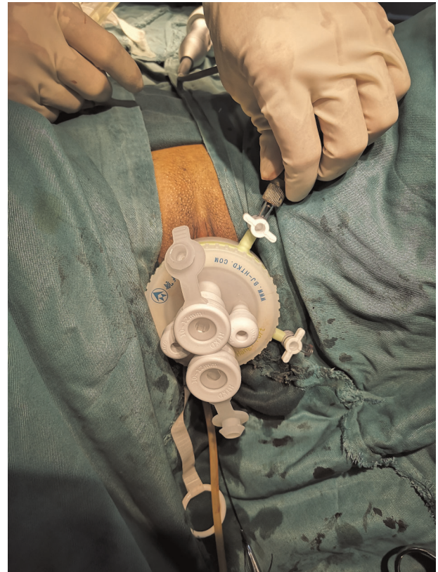
FIGURE 1 | Establish vaginal access.

The patient requires vaginal cleansing one day before the procedure. Anterior vaginal vault approach: cervical forceps or Allis forceps the anterior cervical lip and pull downward, make a transverse incision slightly below the cervical portion of the bladder attachment, bluntly separate the vesicovaginal space, free the bulging bladder, separate the cervical ligament of the bladder and push the bladder upward to the retroperitoneum of the bladder and open the retroperitoneum of the bladder and uterus into the pelvis; posterior vaginal vault approach: cervical forceps or Allis forceps the rear cervical lip and pull upward to expose the posterior vaginal vault. A transverse incision of approximately 2–3 cm is made 1.5–2.0 cm below the cervix to separate the rectal space and enter the pelvis bluntly. The pneumoperitoneum was established by inserting a particular HangT Port (Beijing HangTian KaDi Technology R&D Institute, Beijing, China) vaginal access ( Figure 1 ). A standard 10-mm rigid 30° laparoscope was used through 1 trocar, whereas 2 endoscopic instruments were used through the other two trocars ( Figure 2 ); through the surgical platform, access to remove