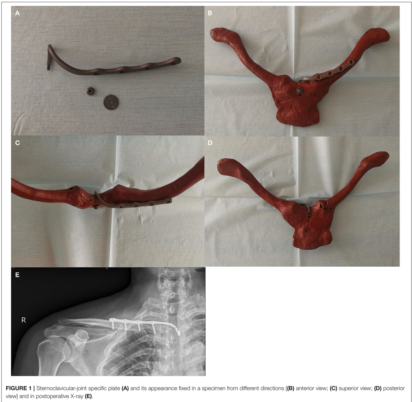
FIGURE 1 | Sternoclavicular-joint specific plate (A) and its appearance fixed in a specimen from different directions [(B) anterior view; (C) superior view; (D) posterior view] and in postoperative X-ray (E).

\pm 8.5 at the latest follow-up ( P < 0.001 ). The mean forward elevation of the shoulder significantly increased from 97.1 \pm 11.0 preoperatively to 163.1 \pm 11.5 at the latest follow-up ( P < 0.001 ) (Table 2).