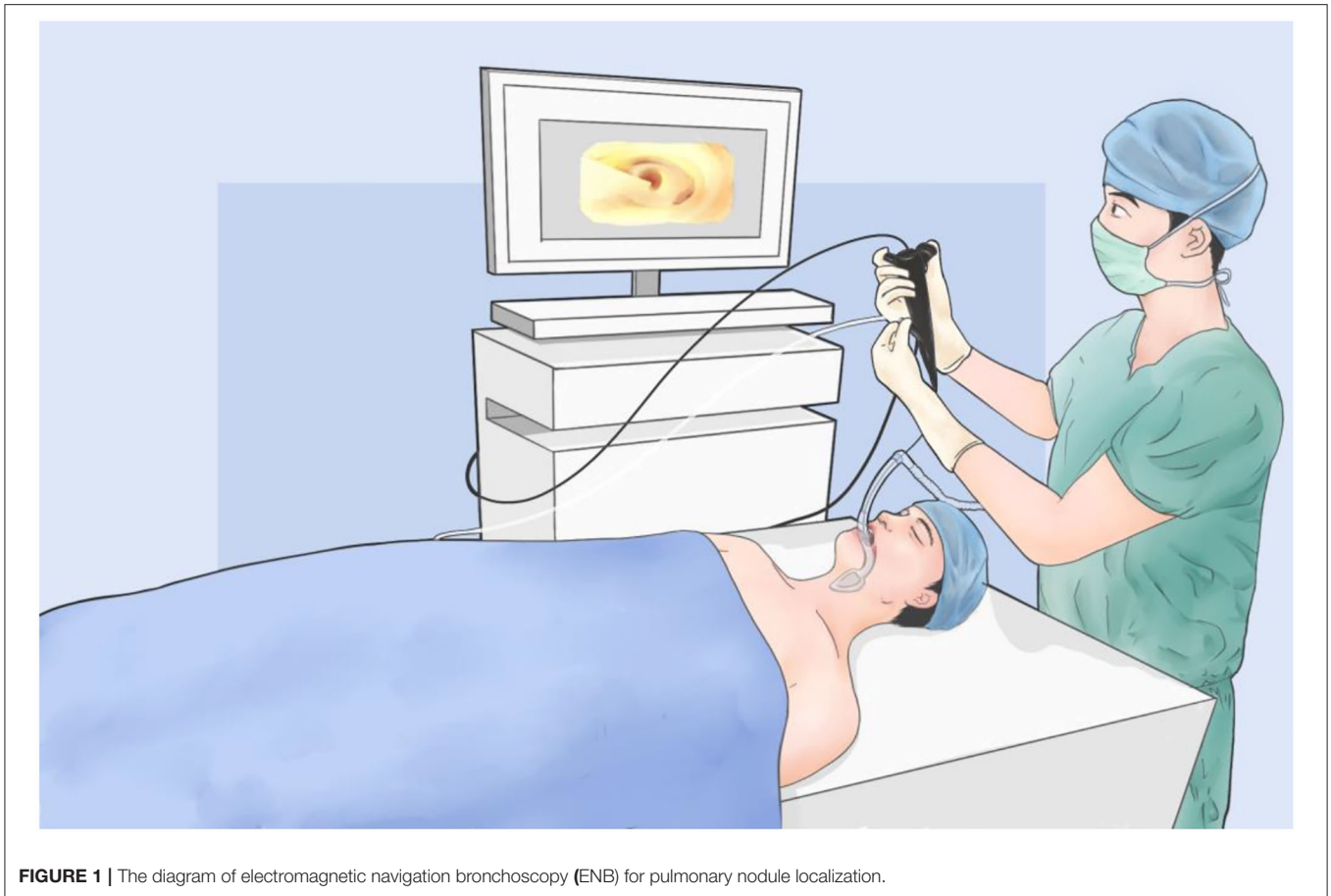
FIGURE 1 | The diagram of electromagnetic navigation bronchoscopy (ENB) for pulmonary nodule localization.

were performed using SPSS Statistic (Version 25, IBM Corp, Armonk, NY.).