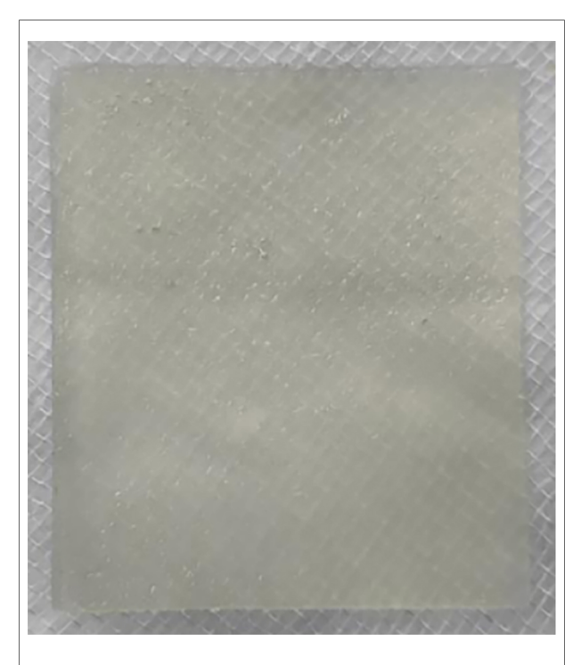
FIGURE 2 Appearance of double-layer artificial dermis.

the nail midline at least 5 mm wide to minimize the disruption of blood circulation to the nail bed. Be careful to maintain the integrity of the nail bed. We turned over the nail bed to expose the sub-bed tissue. After that, the DLAD (Figure 2) from Lando, Shenzhen was soaked in saline for