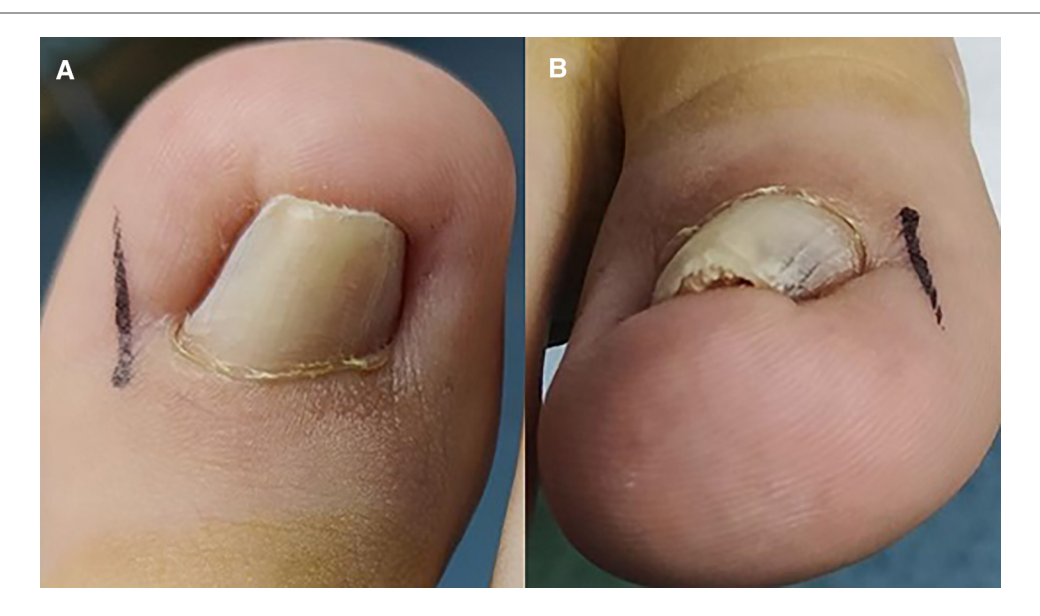
FIGURE 1 Preoperative appearance of affected great toenails at different angles (A,B).