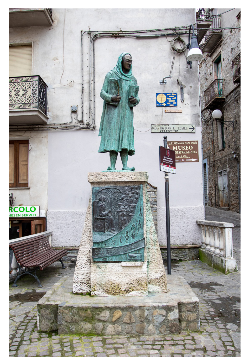
FIGURE 3 The sculpture of Bruno da Longobucco (Bruno da Longoburgo), in the free interpretation of the local artist Thomas Pirillo (1952–2021). Central Square of Longobucco town.

text of education at a time when the printing press was yet to be invented and the cost of a manually rewritten book was highly expensive in time and resource (13).