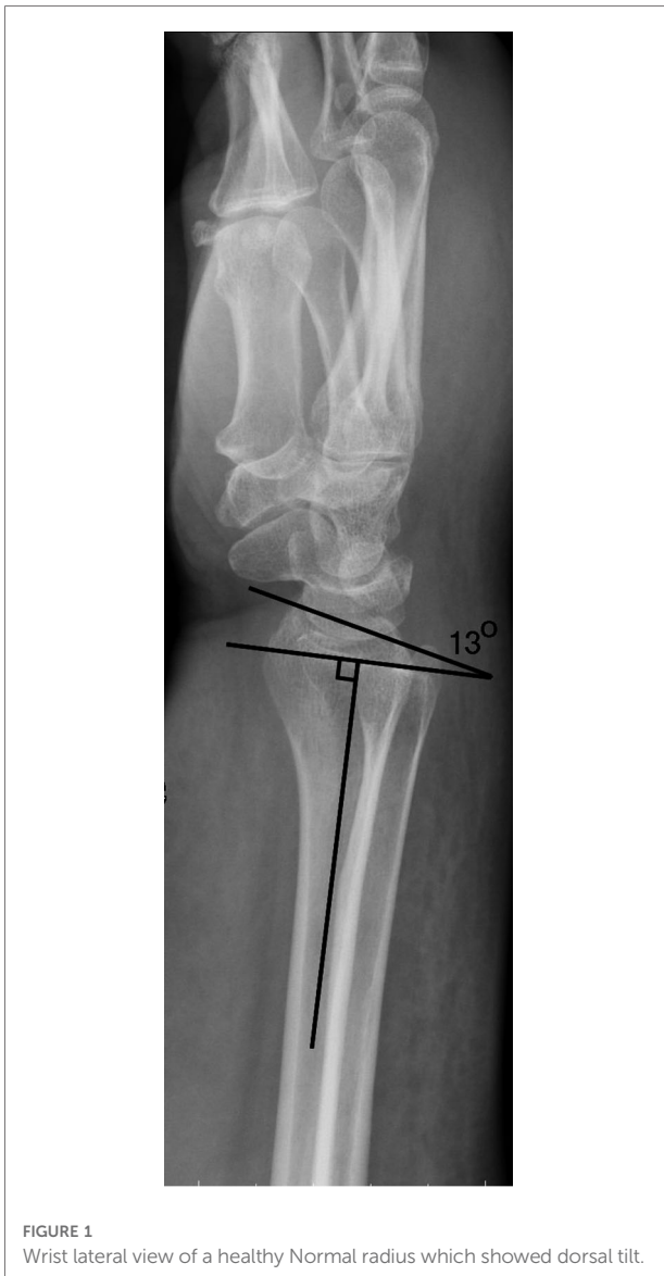
FIGURE 1 Wrist lateral view of a healthy Normal radius which showed dorsal tilt.