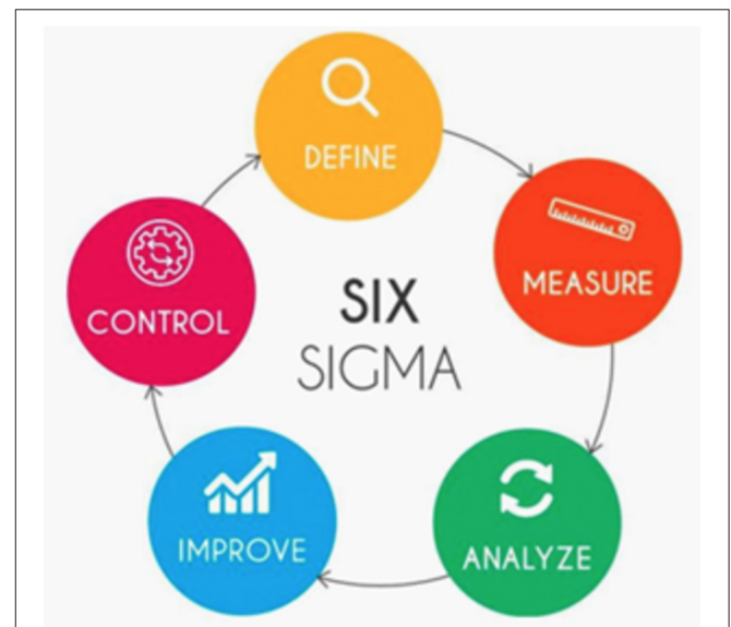
FIGURE 1 | Phases of the six sigma method.

Lean Six Sigma (LSS) is a method originally used to improve the capability of business processes; it combines lean manufacturing/lean enterprise and relies on a collaborative team effort to improve outcomes by systematically removing waste and variations ( Figure 1 ). LSS methodology has been introduced in healthcare since the early 2000s (4), and its professional framework may be the cornerstone to address some points of