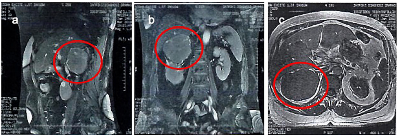
FIGURE 2 | An abdominal MRI scan was performed, and it showed the right adrenal gland lesion. It also showed a clear distinction between the lesion and adjacent structures, without any infiltration to the inferior vena cava, or presence of pathological lymph nodes, nor were there any pathological lesions or enhancement in the liver. A sagittal T2 view (a), a coronal T2 view (b), and a transverse T1 view (c).