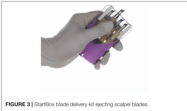
FIGURE 3 | StartBox blade delivery kit ejecting scalpel blades.

preop nurse noted this inconsistency and registered a No Go in the StartBox System. Before the patient was prepared for surgery, the surgeon corrected the record to reflect the left-side approach and a matching Lavender StartBox BDK was paired. The surgical time-out was then completed correctly, and the procedure was conducted successfully.