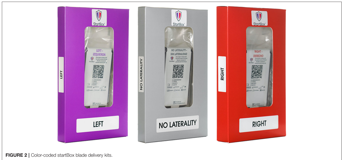
FIGURE 2 | Color-coded startBox blade delivery kits.

Six (6) No Gos were due to inconsistent patient information including incorrect date of birth information, naming errors, and an incorrectly recorded sex. Six (6) No Gos were due to incorrect procedure information including site or description. Five (5) No Gos were due to laterality mismatch.