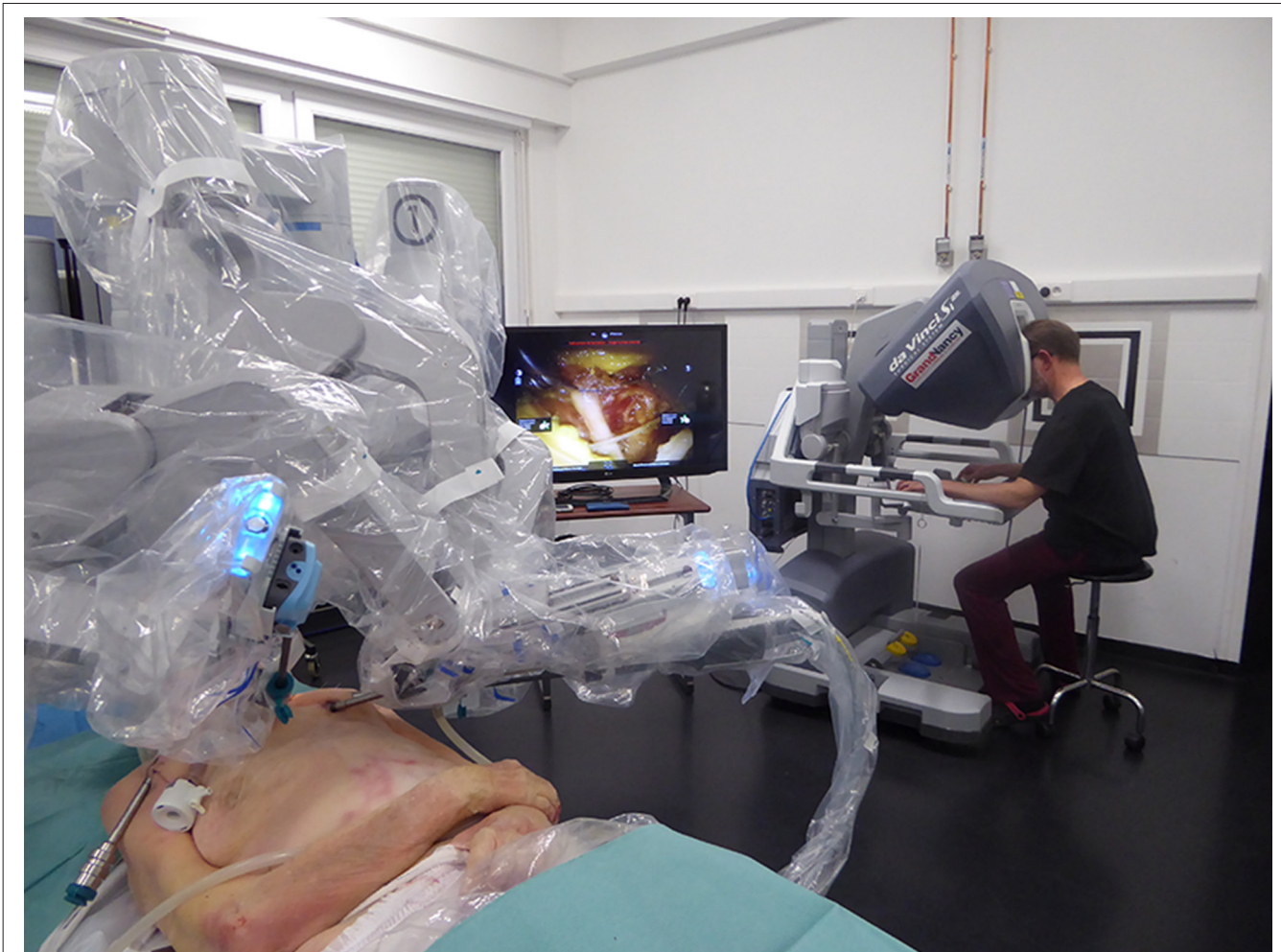
FIGURE 1 | Endoscopic robot-assisted C7 nerve root retropharyngeal transfer from the contralateral healthy side: a cadaver feasibility study. Installation of a da Vinci Si ® robot (Intuitive Surgical ™ , Sunnyvale, CA). In the first plane, the cadaver is in a supine position and the robot is installed at the head to dissect the left brachial plexus. In the second plane, a 2D monitor shows the suture of the two current C7 roots. In the third plane, the operator, installed at the surgical console, telemanipulates the robot's arms. The working space is kept open by blowing CO 2 at 10 mmHg.

this market in order to gain a stake in this valuable industry. Verily Life Sciences ™ (formerly Google Life Sciences ™ ) and Johnson & Johnson ™ are collaborating on the development of a surgical robotic system through Verb Surgical ™ . Medtronic ™ has made sizeable investments in Mazor Robotics ™ that focusses on the development of surgical robots for spine and brain surgery. Furthermore, other less-known companies, such as Auris Surgical Robotics ™ , Cambridge Medical Robotics ™ and TransEnterix Surgical ™ , have each announced their own surgical robotics platform. While several novel teleoperated surgical robotic systems are expected to become available within the foreseeable future, the next generation of partial autonomous surgical robots, capable of suturing skin and creating soft-tissue anastomosis without direct input from surgeons, is already being tested in research laboratories (5).