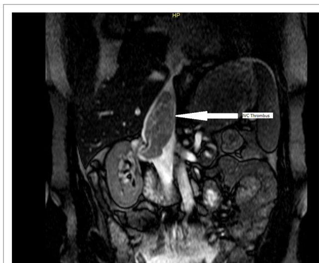
FIGURE 1 | Magnetic resonance imaging image showing extension of the thrombus from the right kidney into the inferior vena cava (IVC) up to the level of the diaphragm, arrow showing IVC thrombus.

Operative time, estimated blood loss, number of packed red blood cells (pRBCs) transfusions, as well as postoperative complications, hospital stay, re-admissions, histopathological findings, and survival parameters were recorded for all patients. No patient had metastatic disease, and all operative procedures had curative intent.