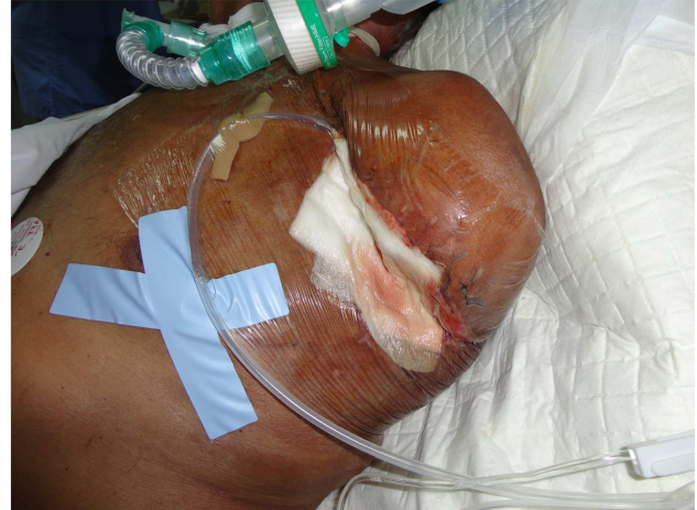
FIGURE 3 | After surgical debridement, the use of the VAC system helps wound healing by absorbing excess exudates; reducing localized edema, and finally drawing wound edges together.

Lately, many surgeons worldwide have started using vacuum-assisted closure (VAC) therapy for fast and effective wound closure