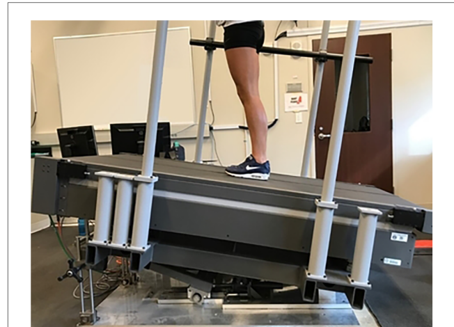
FIGURE 1 Instrumented treadmill used by participants shown at a 4 degree slope.

Each participant wore his or her own recreational gym attire including a t-shirt, shorts, and athletic shoes. The participants