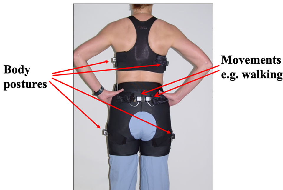
FIGURE 1 Multiple inclinometers and accelerometers integrated into underwear. Reproduced from Levine et al. (23).

Using modern mathematics, human fidgeting can be analyzed for entropy, which is a measure of randomness (25–30). ApEn