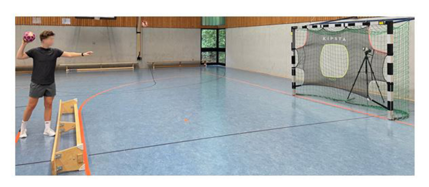
FIGURE 3 Participant performing the 7-m standing throw test

the averaged maximal distances of the best trials for all three reach directions normalized for upper-limb length which was measured during the anthropometric assessment.