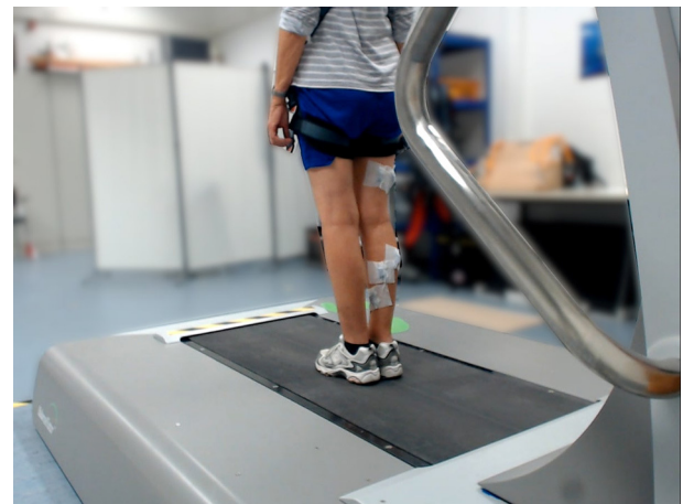
FIGURE 3 | The perspective of the camera.