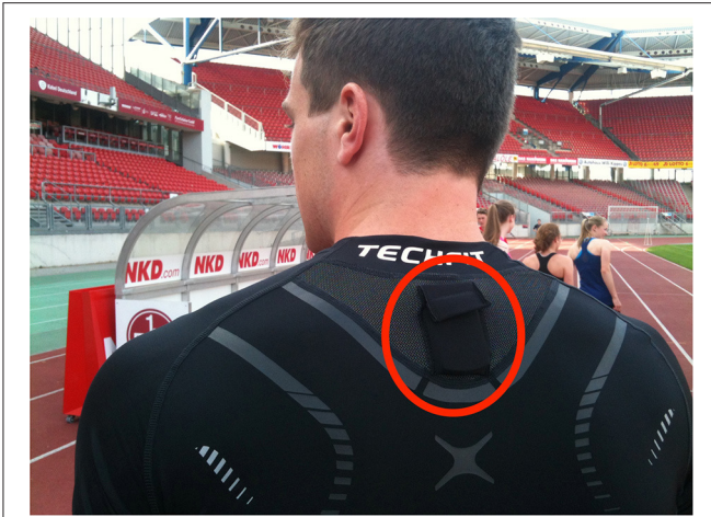
FIGURE 1 | Transmitter placement on the athletes. Transmitters were placed inside a specially designed pocket.

Based on these assumptions, we propose the following procedure to derive TSI parameters from raw tracking data that will be described in detail below: