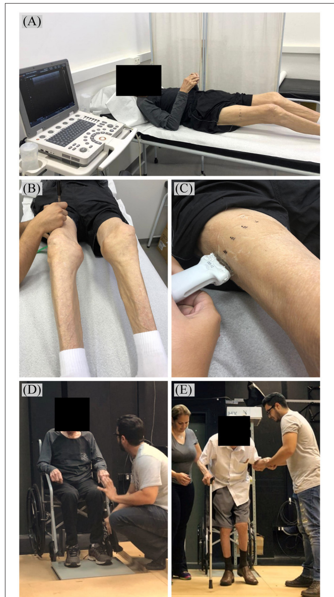
FIGURE 2 | (A) Positioning and (B) skin markings for ultrasound image acquisition of vastus lateralis cross-sectional area and (C) muscle thickness (with ultrasound probe oriented longitudinally to the muscular belly). Timed Up and Go Test (D) instructions and (E) execution.

The functional performance was measured through “Timed Up and Go” (TUG) test with the aid of a force platform (AccuGait, AMTI, USA). The participant’s wheelchair was positioned—and secured—so that his feet were placed on the platform (Figure 2). He started the test sitting with his back on the chair, arms positioned on the side arms and feet on the force platform until the start command. After the command, the participant was instructed to get up as quickly as possible using the armrests of the chair, then walk—with external assistance—a distance of 3 m, return, and sit again with the back against the seat (Miotto et al., 1999). The first trial was a familiarization session and the second trial always served as the test session. Balance Clinic software (AMTI, USA) was used to compute the total time to complete the task. The TUG time was also divided into two components: (1) time spent atop the force plate at the beginning and ending of the test, which can approximately reflect the time used to get up and sit back on the chair, and (2) time spent off the force plate, i.e., time in which no forces are being applied to the platform, and thus, can approximately reflect the walking portion of the test. The CV’s for the full TUG test, the time spent on the