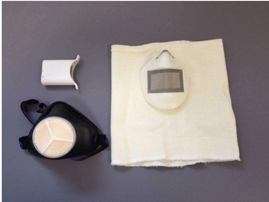
FIGURE 2 | Three representative types of HME: Lungplus (upper left), AirTrim (lower left), and Jonaset 0602 (right).

date has set out to evaluate potential prophylactic effects of HMEs to prevent airway damage or asthma in healthy athletes. Following a high-intensity exercise bout in -20^{\circ}\text{C} , without use of an HME, Frischhut et al. (2020) reported post-exercise decreases in FVC and \text{FEV}_1 in healthy athletes. HME usage attenuated these responses, and also resulted in fewer respiratory symptoms (Frischhut et al., 2020).