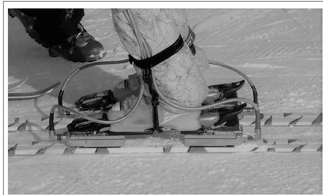
FIGURE 1 | Set up of the FP between the bindings and the skis.

capacitive sensor. The PI were located inside the liners of the ski boots and the proper size was selected for each skier and replaced their normal insoles. All pressure insoles were calibrated prior to the measurements following the manufacturer's instructions. The Novel data logger, battery pack, and trigger switch were carried in a belt (1 kg in total) attached to the Kistler backpack.