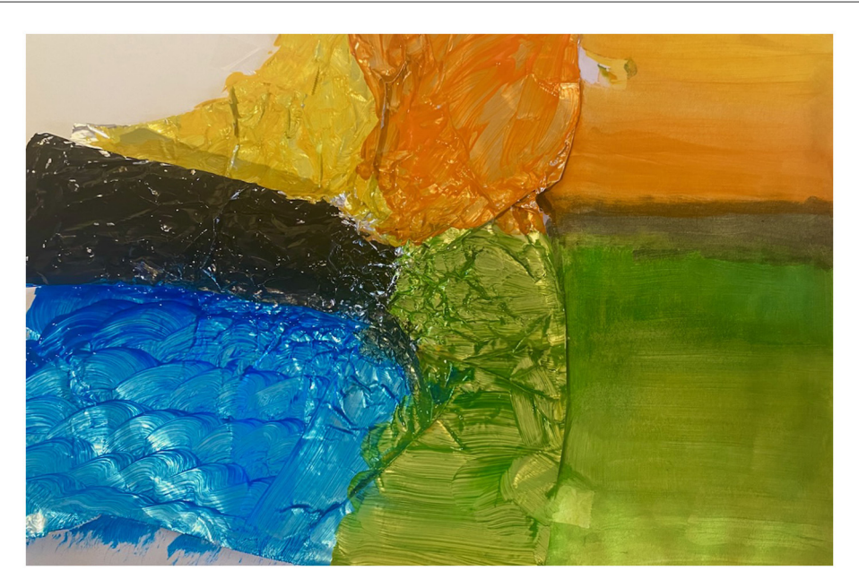
FIGURE 3 The participant painted the forearm in black, flattened the fist, and surrounded it with bright blue, green, yellow, and orange. These colors spill off of the foil and onto the large sheet of paper beneath it.

do the important work of creating space for anger in transplant's hegemonically positive affective economies. In so doing they also reaffirm how curative imaginaries position angry affects outside of socially sanctioned affective ecosystems in solid-organ transplantation. Separating matter out of place preserves the