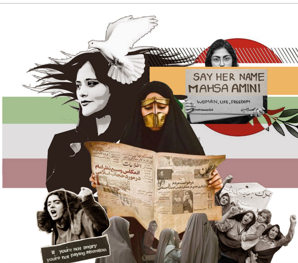
FIGURE 2 A collage of defiance and peace: a juxtaposition of women’s activism and symbolism in ‘Woman, Life, Freedom’ Movement with layered images of protest, hashtags, cultural elements, and a call for freedom.

The “Woman, Life, Freedom” movement represents a critical juncture in feminist activism within Iran, propelled by the tragic death