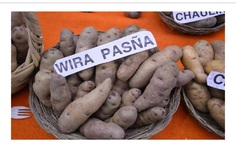
Image of the native potato Wira pasña. Source: Ministry of Environment. Uploaded on September 12, 2011. Taken on September 10, 2011. https://acortar.link/3sKnoM.