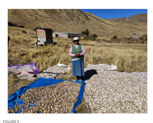
The preparation of chuño , Wira pasña variety, in the Andean community of Usmay. Source: Authors' photograph (July 2023).

Yana llumchuy waqachi potato (black potato that makes the daughter-in-law cry) exhibited by a producer at the "XIX Custard Apple Festival X Avocado Festival EXPO 2023" Ninabamba-VRAEM July 10–14, at an altitude of 2,331 m. Source: Authors' photograph (July 2023).