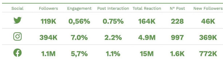
FIGURE 1 Scan conducted with Fanpage Karma between March and December 2020.