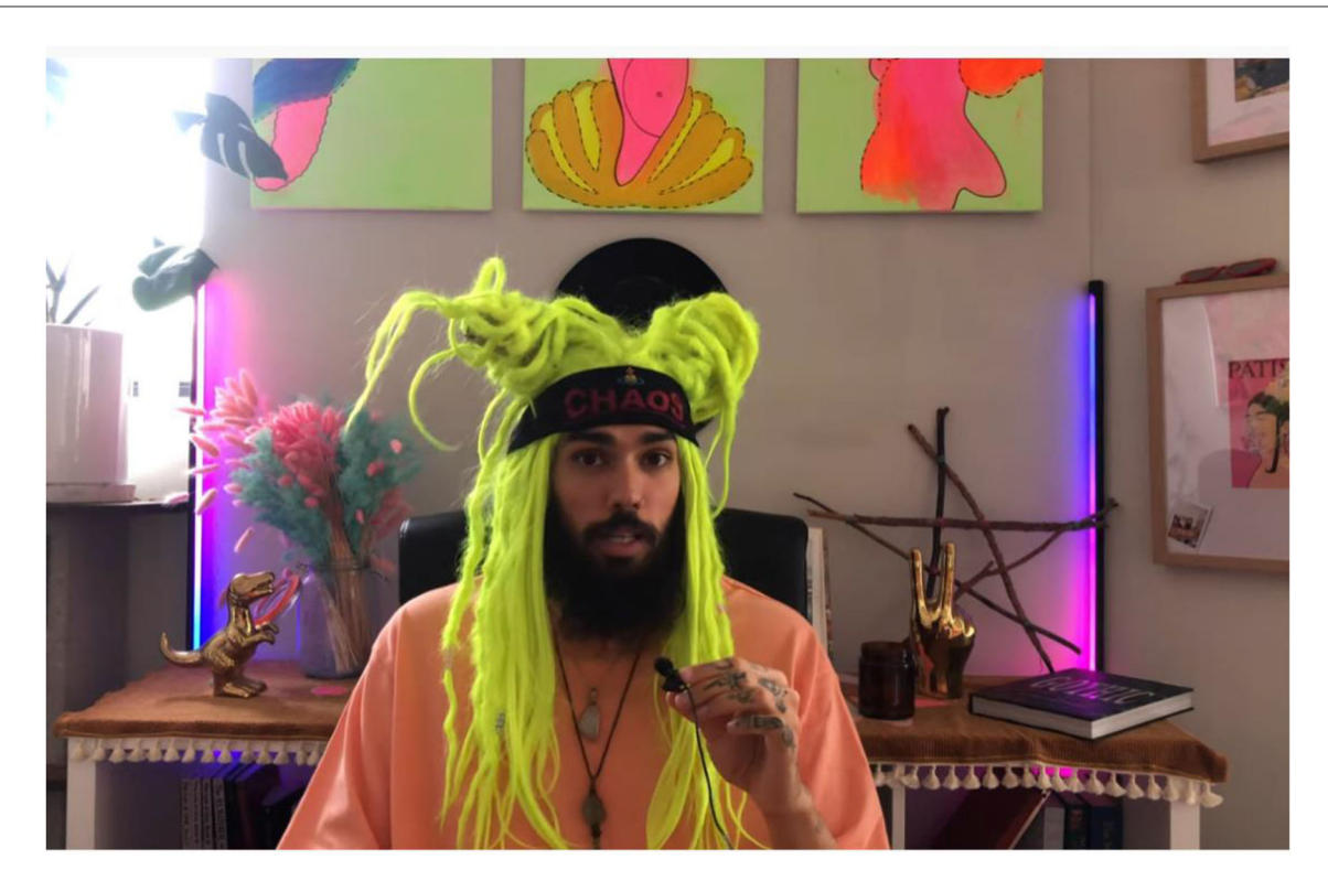
FIGURE 3 Akashic Daddy via Instagram.

yelling in the chamber was a shamanic practice meant to cleanse it from evil