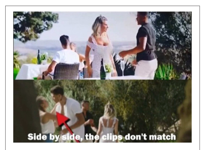
FIGURE 2 | Screenshot of edited video footage showing the kiss was filmed twice (Shadijanova, 2018). Used with copyright holder's permission.

The way in which race is represented in Reality TV has been a long-running area of concern (Orbe, 2008; Squires, 2008). Love Island has appeared to continue this uneasy trend, with