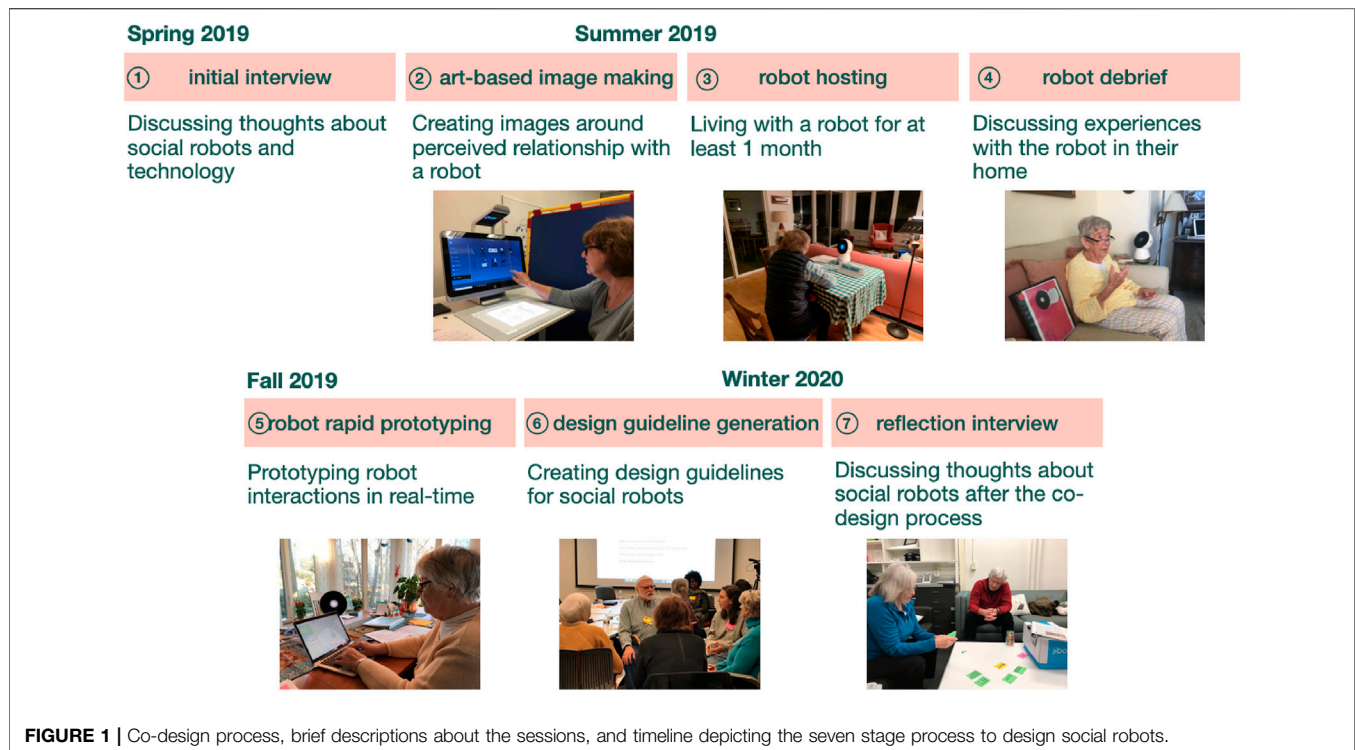
FIGURE 1 | Co-design process, brief descriptions about the sessions, and timeline depicting the seven stage process to design social robots.

described (Harrington, 2020), and respecting older adults' pride, esteem, and dignity (Zhang et al., 2020). Participatory design tools, such as PhotoVoice, can be used as a method of eliciting storytelling for design exploration that "humanize (s) a community beyond disparities and negative perceptions" (Harrington, 2020). In addition, Vines et al. (2015) advocates for engaging with older adults' personal histories and how they impact older adult technology use and future ideas for technology.