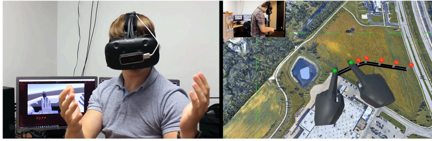
FIGURE 1 | Our setup showing the Leap Motion device affixed onto a HTC Vive VR headset ( Left ). Virtual hands (on screen) positioned in VR in place of the real user's hands ( Right ). This figure is being published with the written informed consent of the depicted individual.