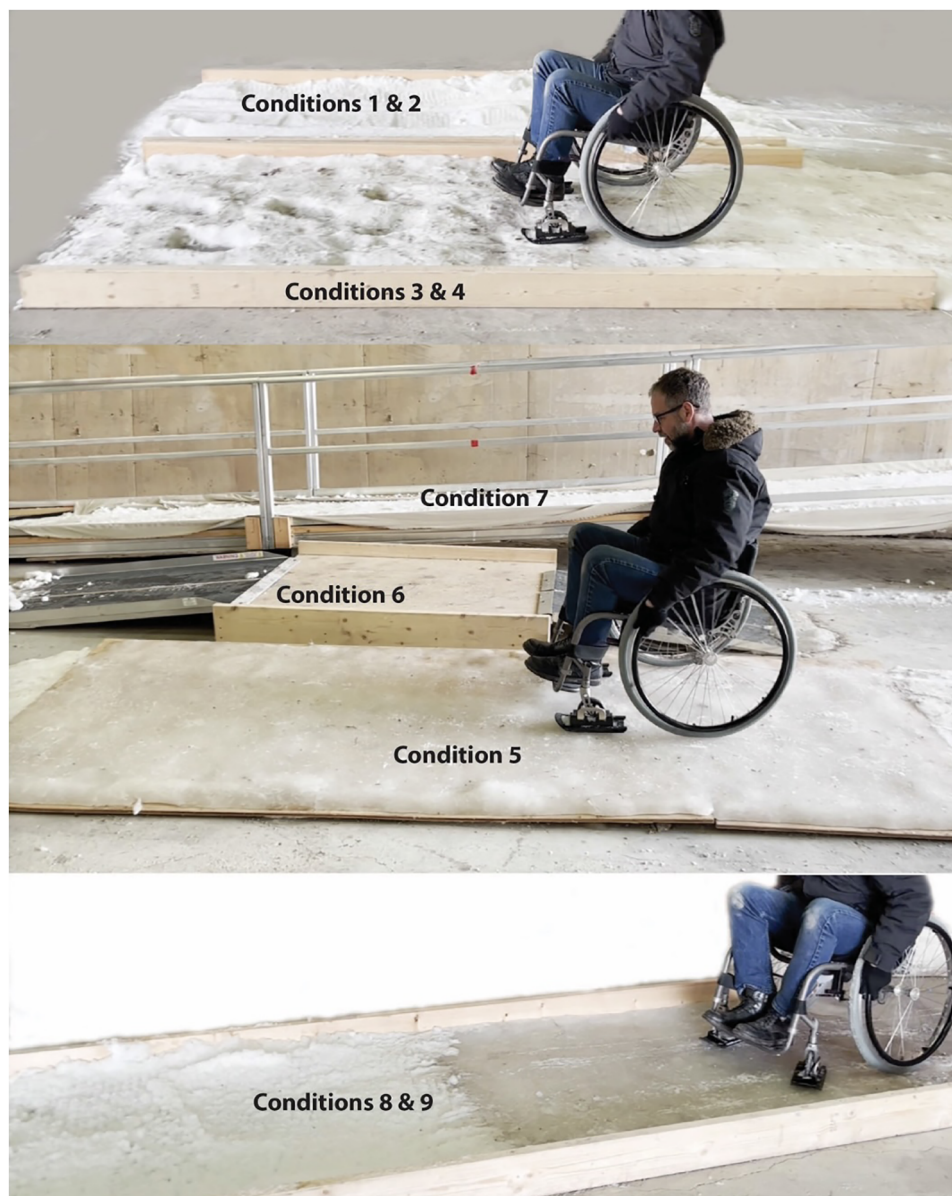
FIGURE 3 Photo of SNOWMAN course in January 2023.

protocol involved measuring and recording ambient temperature and humidity; snow depth, surface temperature, hardness, and density on snow-covered obstacles; and coefficient of friction on icy surfaces.