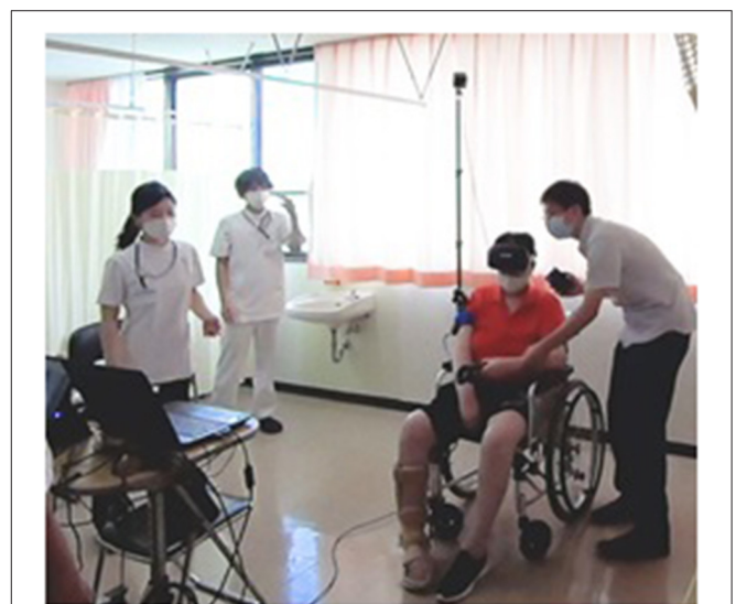
FIGURE 2 | mediVR KAGURA® (VR, virtual reality).

In spite of lack of academic resources and overwhelming workload in clinical practice, research, and education, the author has attempted to provide “handmade” medical education. One is through clinical education with the use of rehabilitation robotics, including virtual reality (VR) and myoelectric prosthetic hands. These are among the most advanced medical devices that can stimulate the curiosity of young people (Figure 2) (6). At Saga University Hospital, Japan’s first “Robot Rehabilitation Outpatient Care” was launched on October 1, 2014. Its purpose was to create a high-quality rehabilitation healthcare system that utilizes rehabilitation robotics. Patients are referred from all over Japan, which ultimately contributes a critical mass for an education system (7, 8). This initiative utilizes participatory clinical training for medical students, interns, and residents. It is an education system that allows independent participation making it easier for students to comprehend what is being taught. Experience in rehabilitation medicine